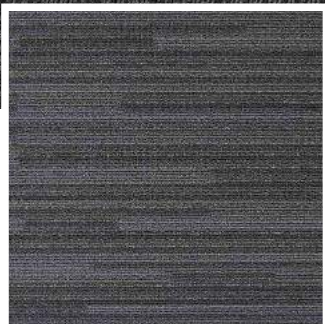
Ambition - Shadow