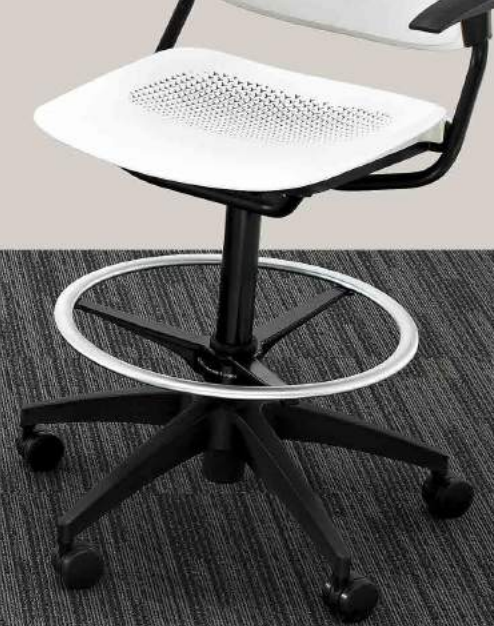
Ambition - Motley