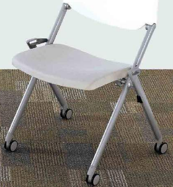
No Rules - Honey