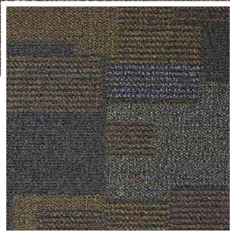
No Rules - Mustard