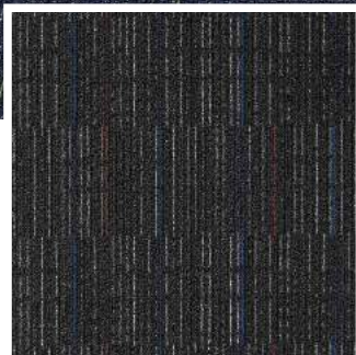
Rhapsody - Black Line