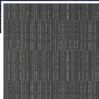
Rhapsody - Olive Leaf