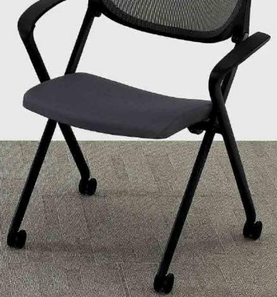
Shift - Powder