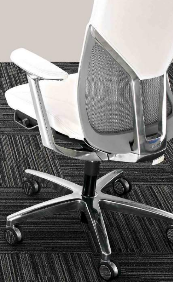
Unique - Dark Way